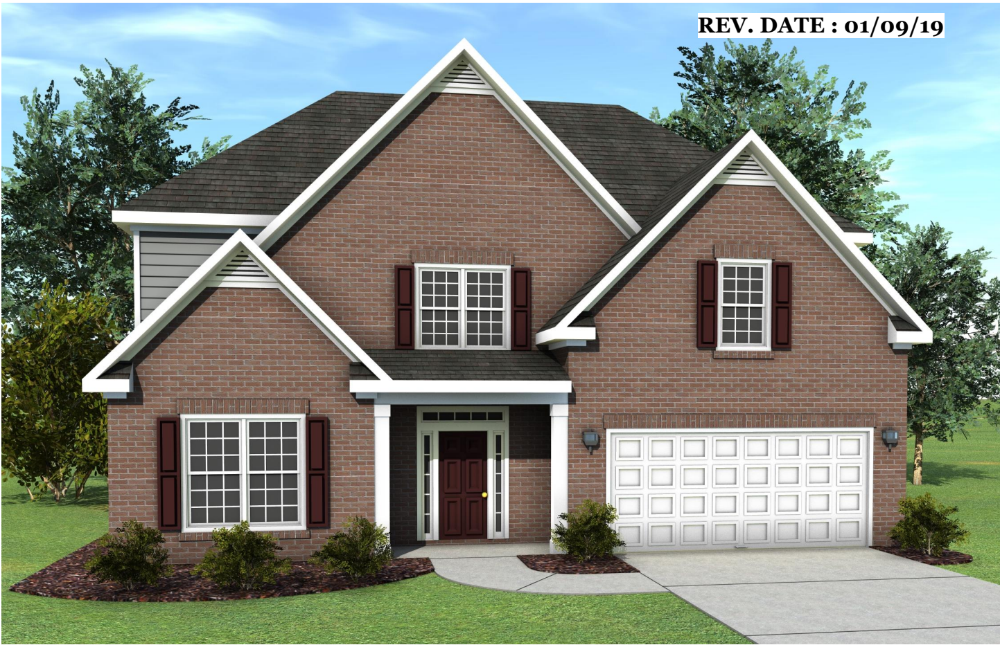
THE TRENT ELITE @ LONGLEAF FRONT ELEV-.A